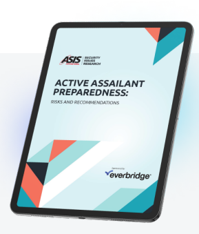
2024 Active Assailant Preparedness Report Download report →