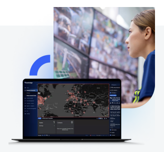
Be active assailant ready Request demo →

Everbridge is more than just a technological solution; we are a strategic partner dedicated to strengthening businesses against the unpredictable challenges of active assailant incidents. Our solutions empower organizations to adopt a proactive stance, navigate crises with confidence, and emerge stronger, minimizing potential losses and safeguarding their most valuable assets—people.